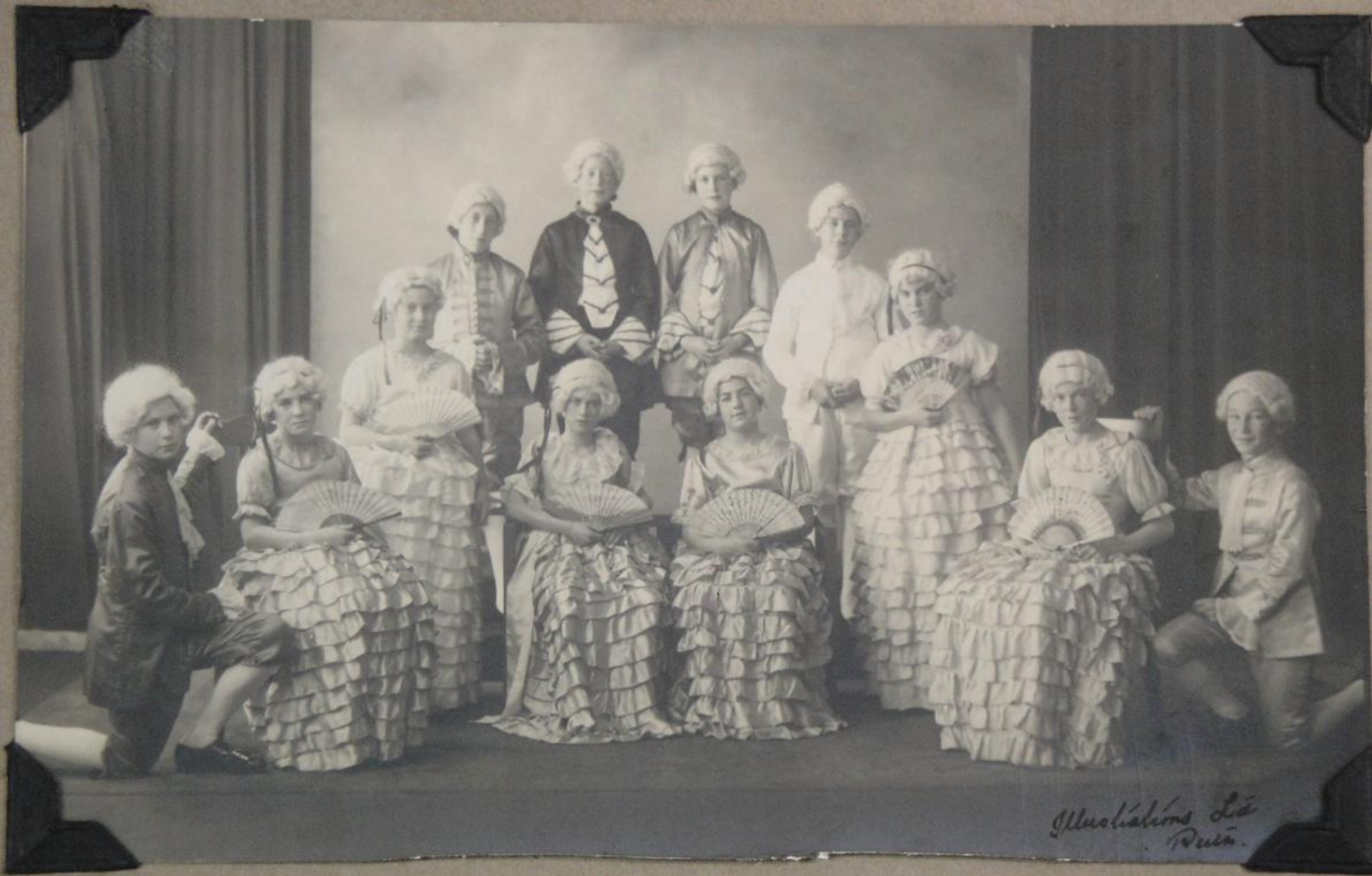
CBHS HIGHGATE, CONCERT 1936. GAVOTTE GROUP.