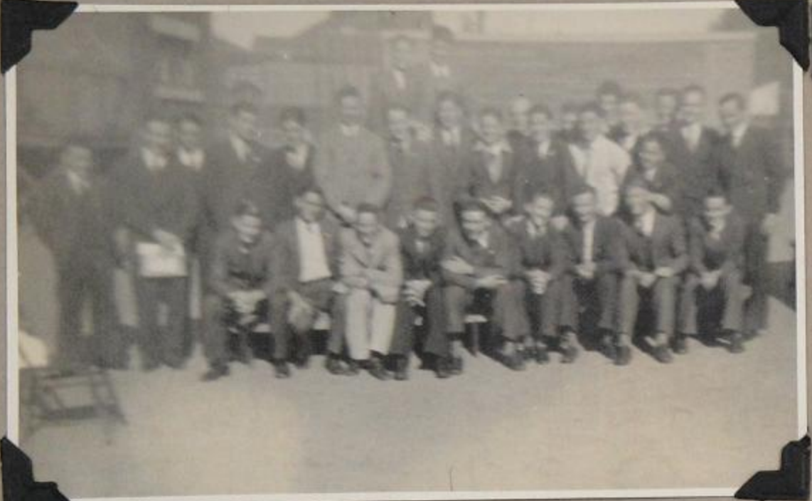
FIRST OLD BOYS' RE-UNION & BREAKFAST 1941