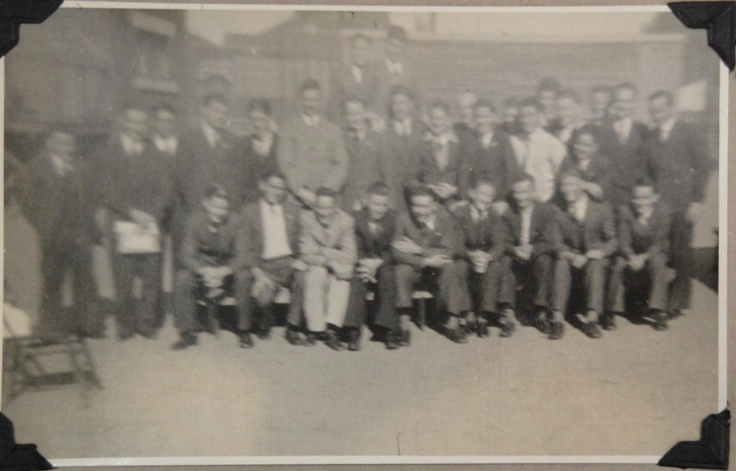
FIRST OLD BOYS' RE-UNION & BREAKFAST 1941