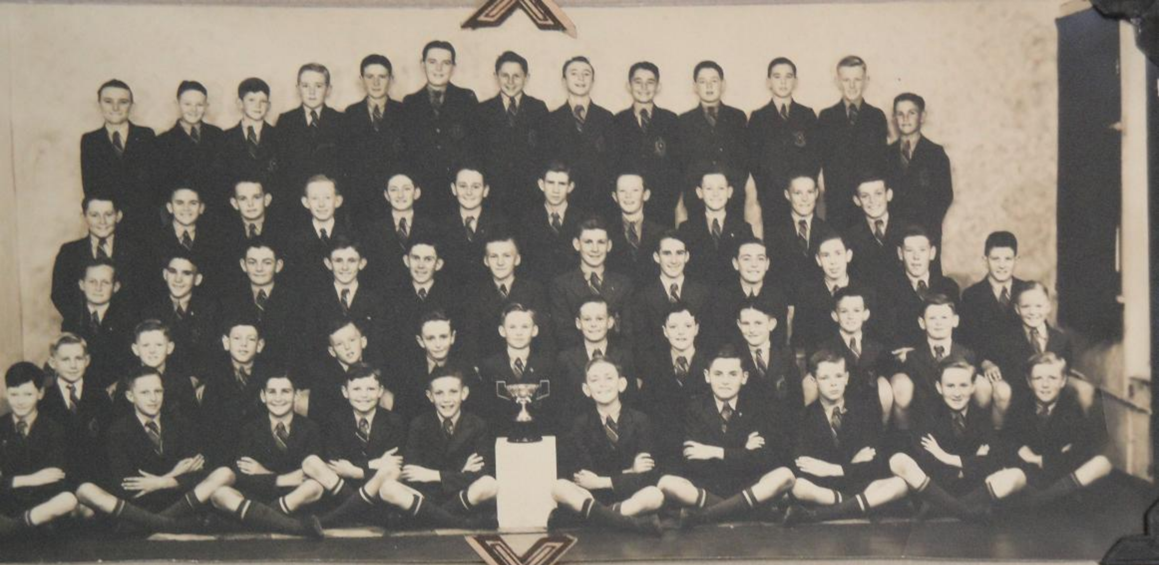
CBHS CHOIR, PRIZE WINNERS, PERTH FESTIVAL, 1940