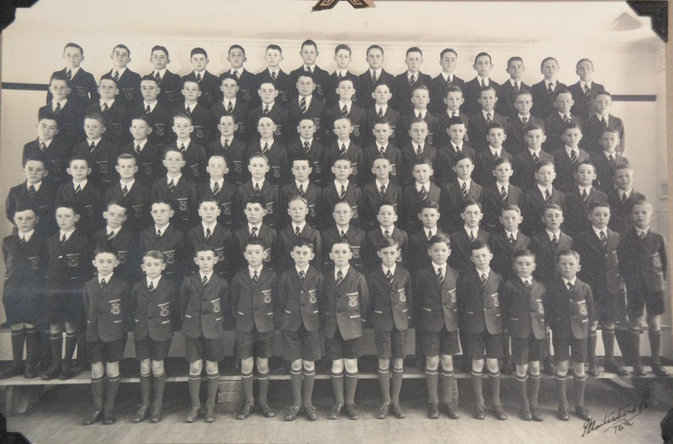
CBHS - FIRST CHOIR, 1936.