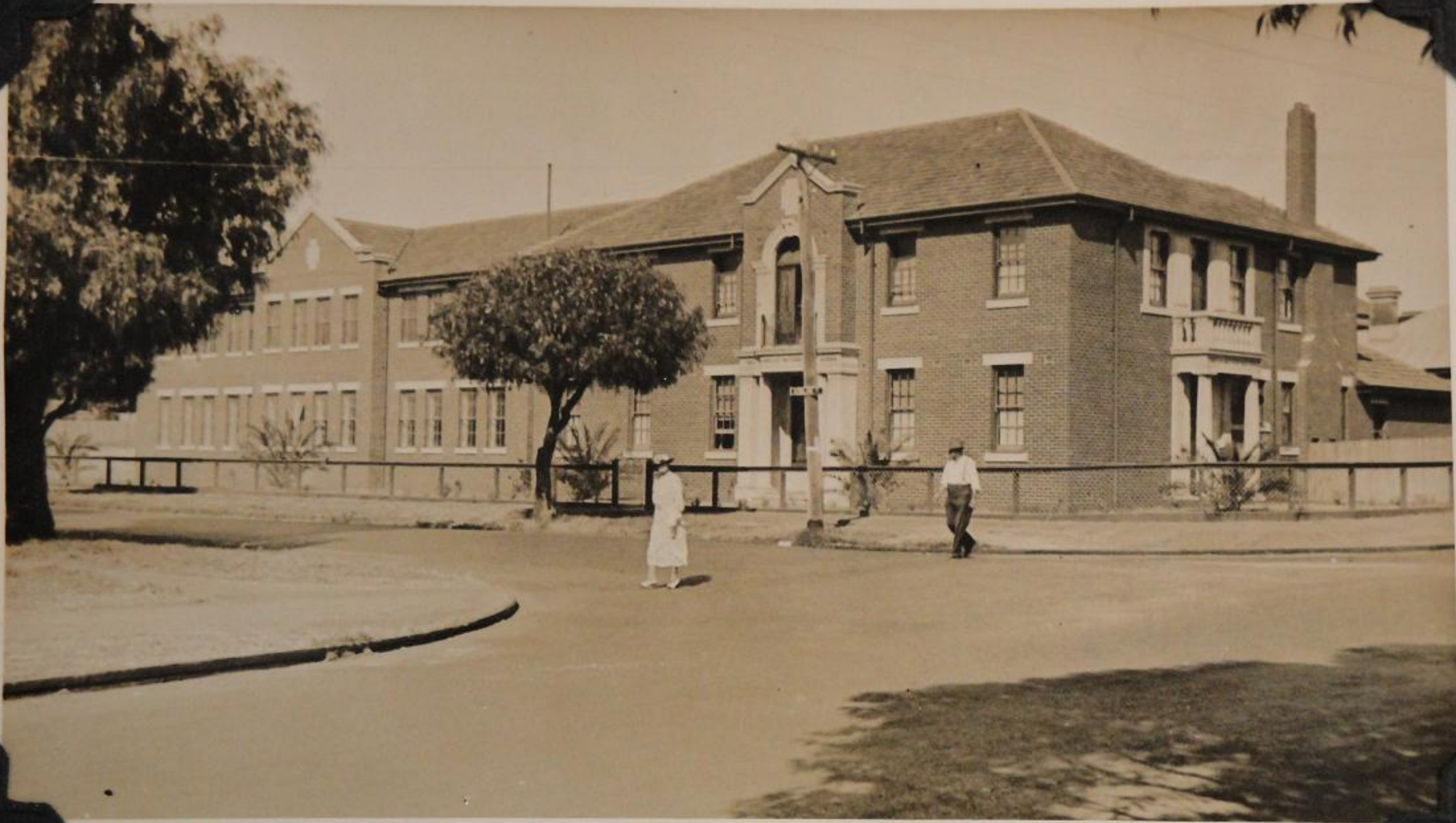
HIGHGATE; SCHOOL, left; MONASTERY, right